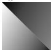
extra clear graphite